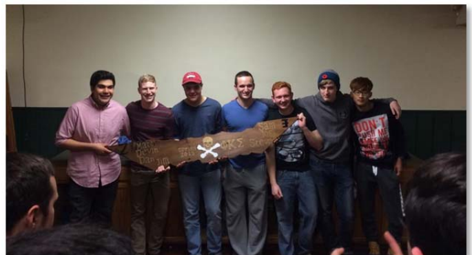
Spring 2015 New Members