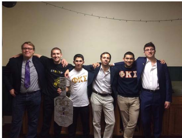
Fall 2014 New Members with Their Big Brothers